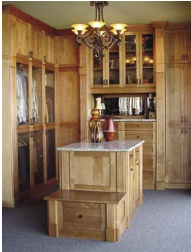
Closetsandmore Maple with Shaker Style Doors and Drawers